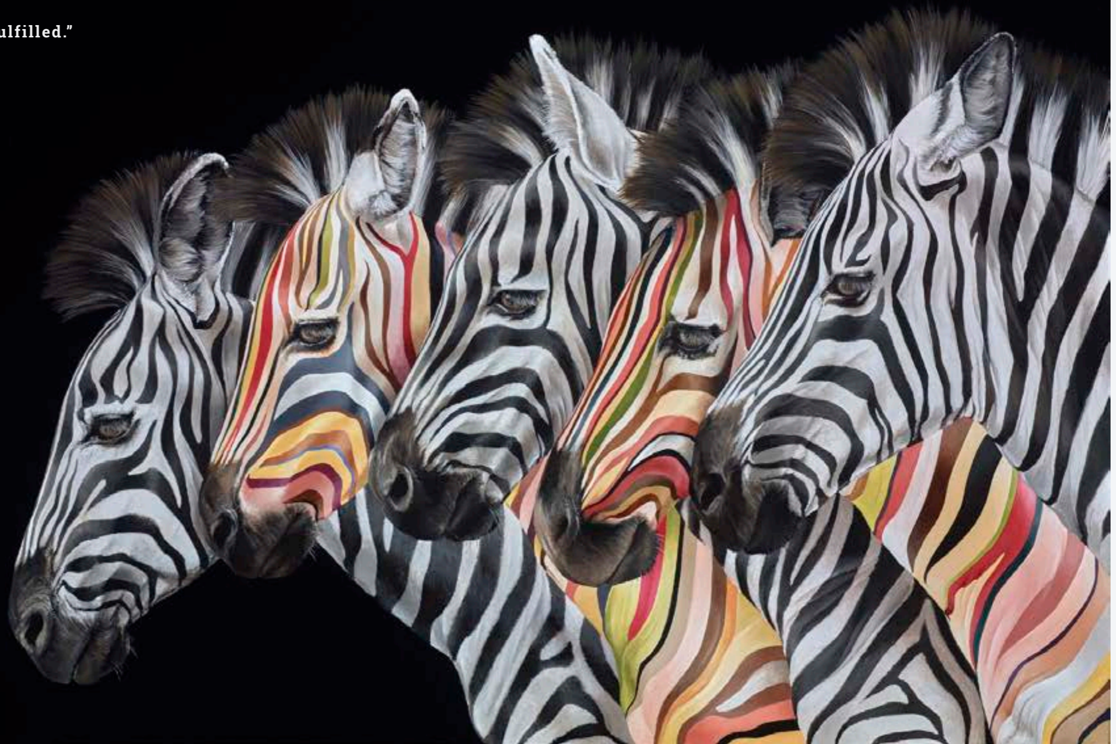
Dare to Be Different II Original Painting on Box Canvas 40 x 30"

"If I bring joy and happiness through my artwork I am fulfilled."