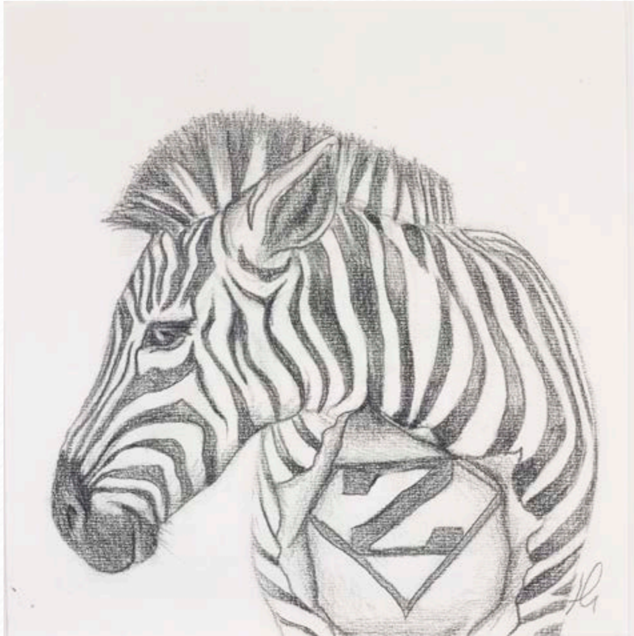
Zooperman Study Sketch Original Drawing on Mounted Paper 8 x 8"