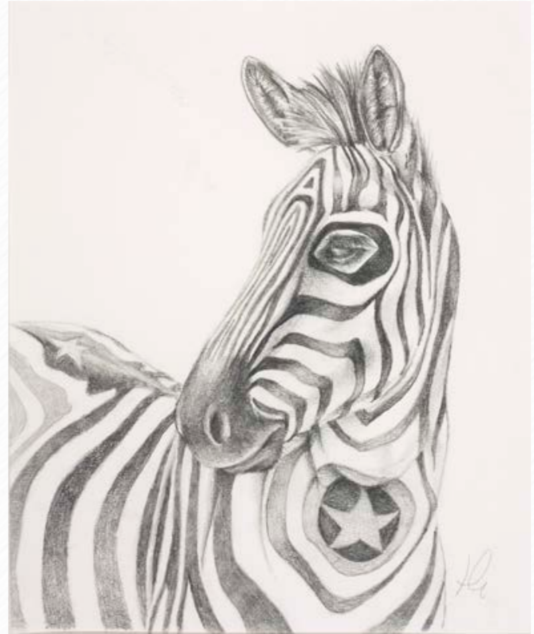
Captain America Study Sketch Original Drawing on Mounted Paper 8 x 12"