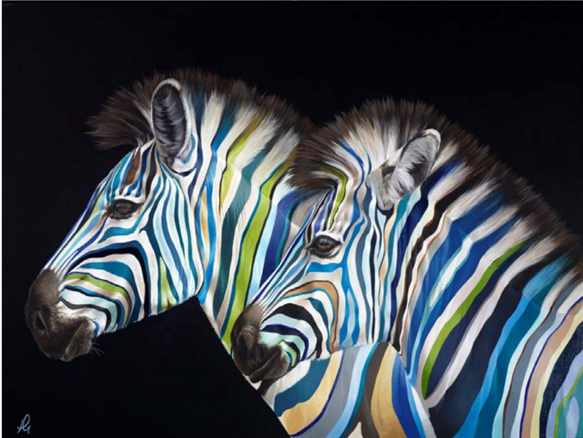
The Blue Duo Original Painting on Box Canvas 40 x 30"