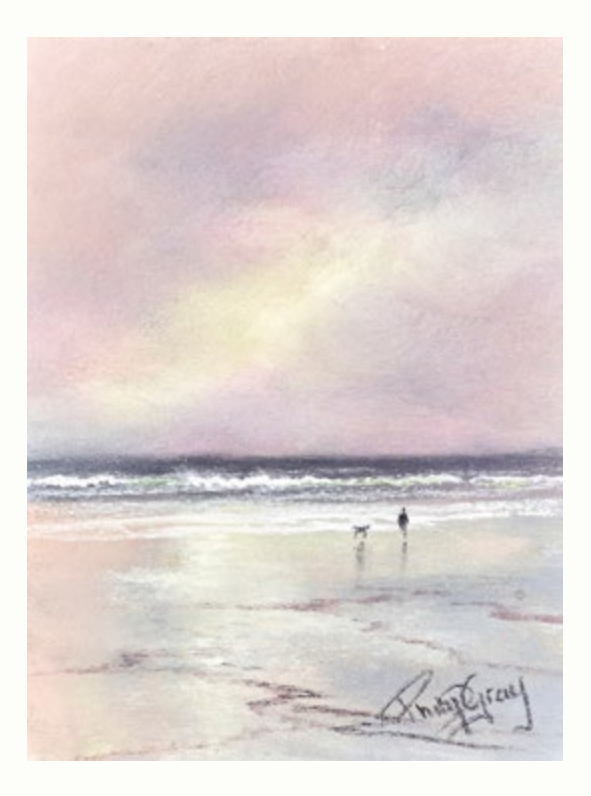
A MAN'S BEST FRIEND II

32 X 32" Original Painting on Box Canvas £7,225