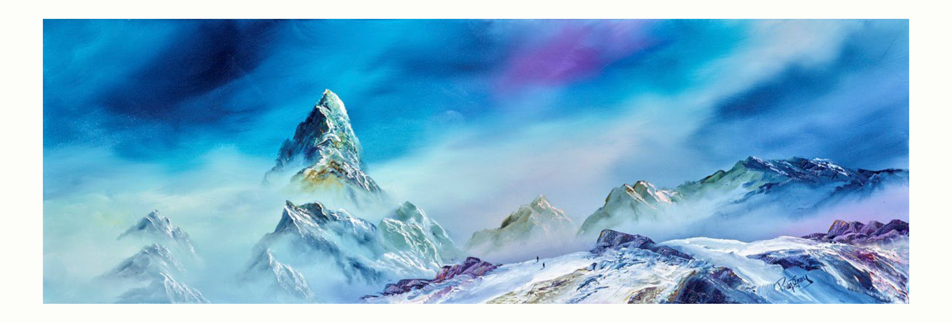
THE LIGHT SHOW 20x20° Canvas on Board 6123-625