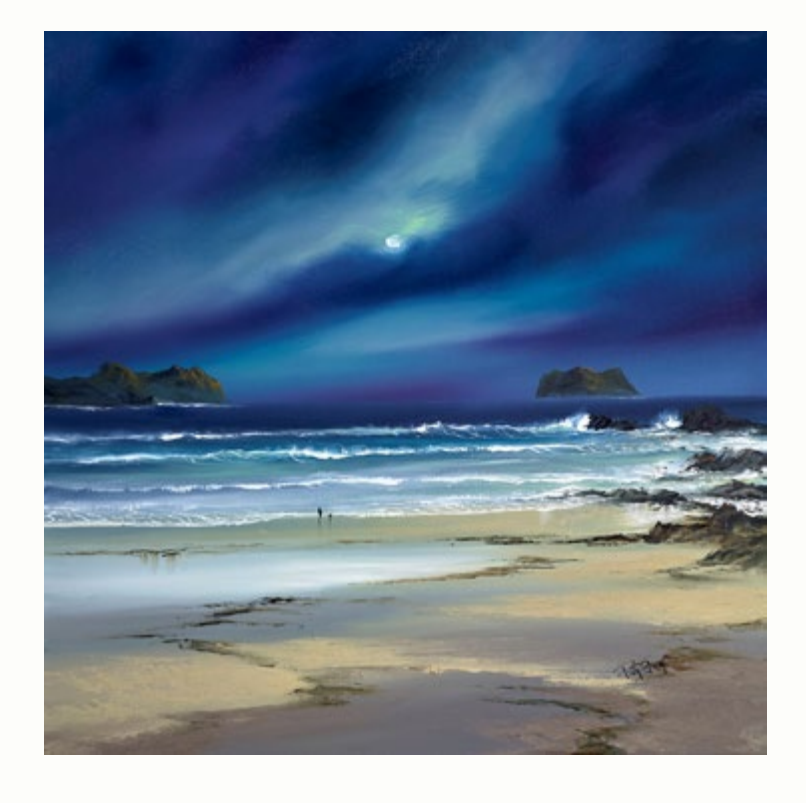
A LOVELY WALK II

32 X 32" Original Painting on Box Canvas £7,225