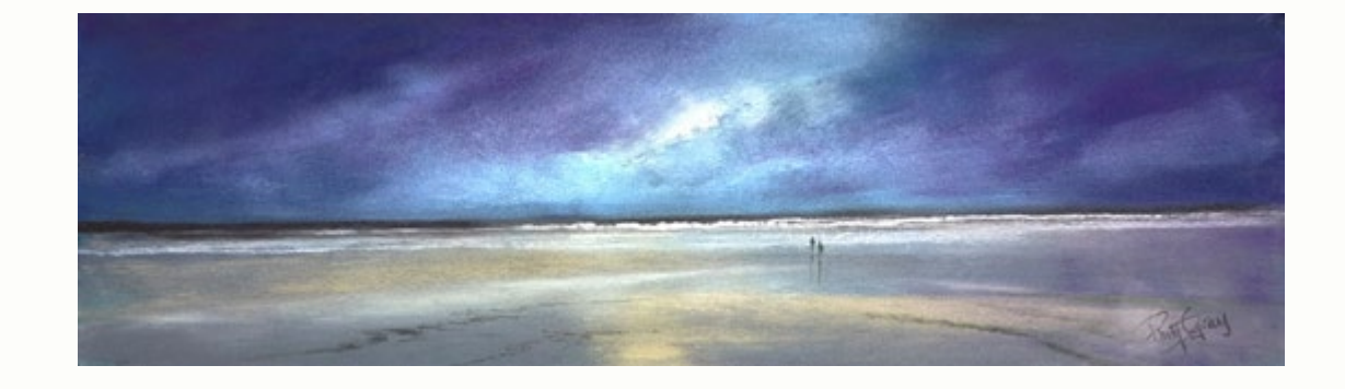
A COASTAL STROLL III

24 X 7" Original Drawing on Paper £2,125